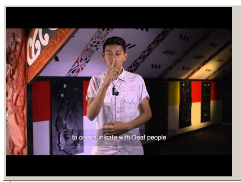
Video hosted on Youtube http://youtu.be/_4Zk4WDJkhs Closed Captions

Six rangatahi who identify as deaf communicate their aspirations.