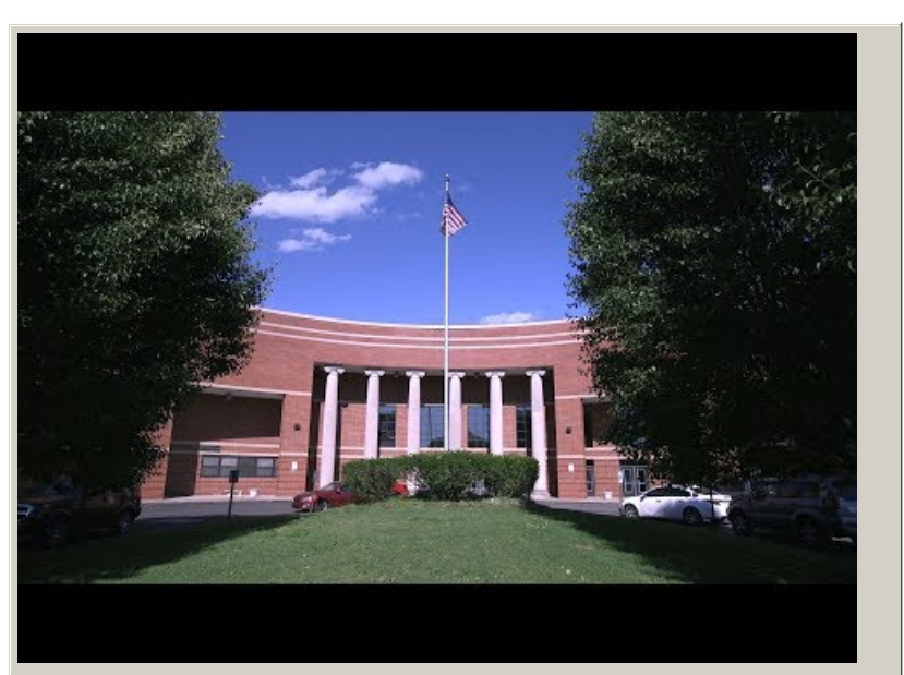
Video hosted on Youtube http://youtu.be/L6Kxd5Dp6K8 Closed Captions

Teaching social and emotional learning as part of literacy lessons has a significant impact on students' learning and wellbeing.