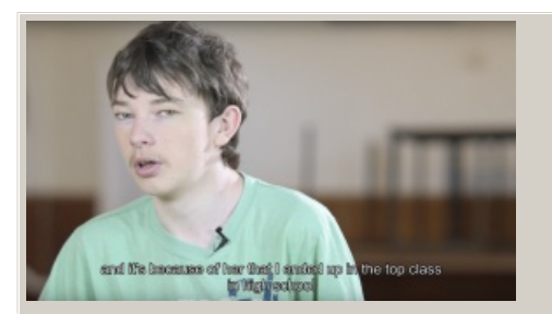
Video hosted on Youtube http://youtu.be/McAgVbOsLnc

He also describes the negative impact of a different teacher's behaviour.