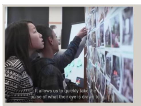
Video hosted on Youtube http://youtu.be/4y2IaAC5vj4

Use visuals and handson activities to maximise participation and understanding.