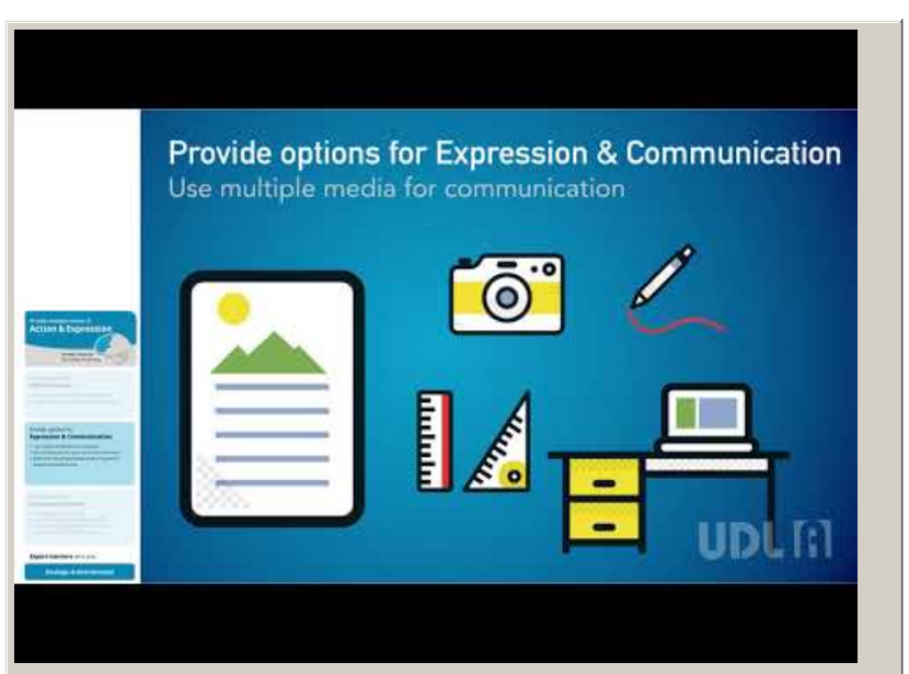
Video hosted on Youtube http://youtu.be/6TupyBVkR7w Closed Captions

What new options could you offer learners?