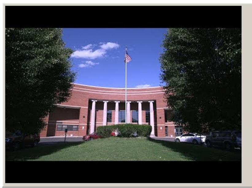
Video hosted on Youtube http://youtu.be/L6Kxd5Dp6K8 Closed Captions

Teaching social and emotional learning as part of literacy lessons has a significant impact on students' learning and wellbeing.